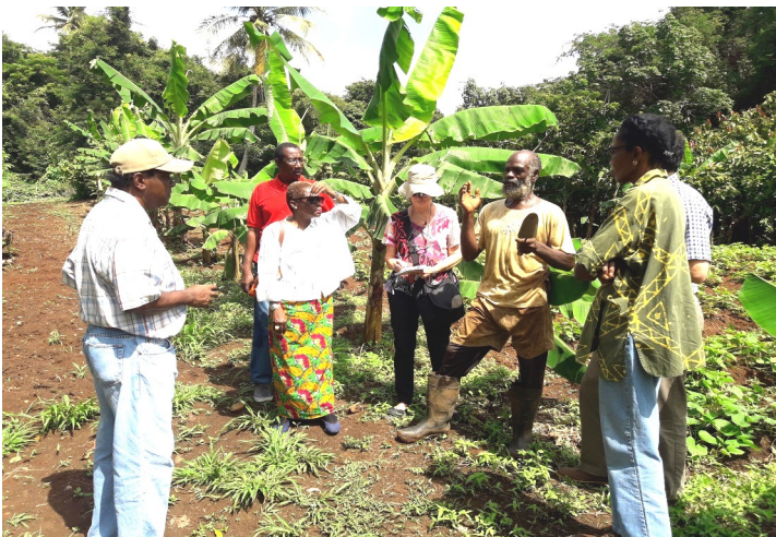
First site with the IAF team; Simzville in Hope, St. Andrew's

be used to assist in the preparation of writing projects in simplicity while addressing the various environmental concerns within the communities of the different countries while simultaneously address the Gender equality issues and solution into the adaptation policies . Allowing persons to see how it impacts women and children in particular.