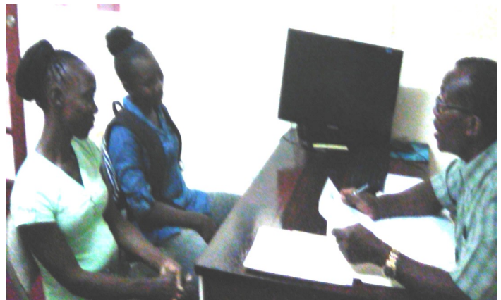
Scholarship performance review 2017 with the Chairman of the Board of Directors