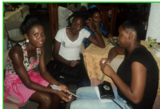
Some of GRENED's Alum at the Christmas gathering