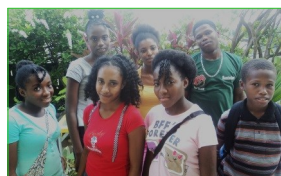
some students at a Leadership Development Training Seminar

GRENED believes education is a holistic, all-inclusive, and life-long experience. Literacy, good values, acceptance of diversity and the ability to manage life's many challenges are therefore seen as critical. GRENED provides personal development and leadership training every month so that scholars can emerge