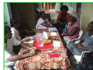
Second meeting of the Parent Committee

The Committee suggested a raffle in order to assist in the provision of materials for the various programmes and training sessions. The raffle is ongoing.