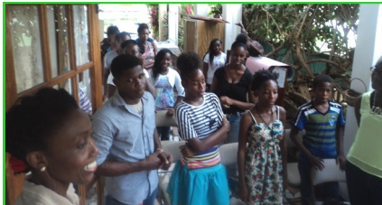
Scholarship recipients and past students

The Grenada Education and Development Programme, GRENED, awarded four (4) new students Scholarship bringing its total 26. Each student were provided each with $350 worth of school supplies and uniforms. At the ending of the school term an additional $300.00 will be allotted to them