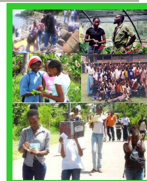
Past GRENE D Science

Methods of teaching is participatory and includes Classroom sessions, Artistic expression drawings, poems and calypso music; Community Service Research projects and Field Trips.