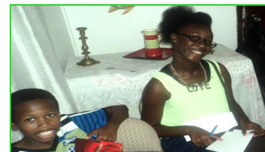
Two new awardees

GRENED continues to need your financial support to be able to continue these direct awards in order to support at least 26 students for the